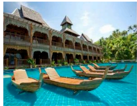
+ Click to enlarge

The new 'Santhiya Supreme Deluxe' rooms have been designed in keeping with the resorts traditional Thai style, featuring intricately carved wood, rich fabrics and handcrafted furnishings to create an authentic ambience. All accommodation is constructed using natural materials.